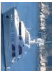
Sensation 49.9m (163.71ft) Sensation Yachts 2007