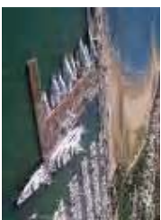
Vilanova Grand Marina Vilanova i La Geltrú, Barcelona, Spain Ports & Marinas